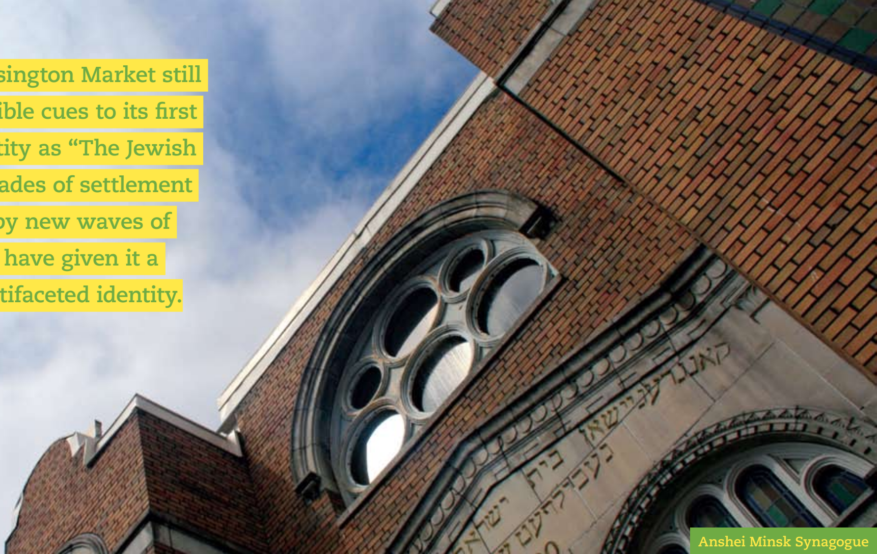
Anshei Minsk Synagogue

Though Kensington Market still carries indelible cues to its first notable identity as “The Jewish Market,” decades of settlement punctuated by new waves of immigration have given it a distinct, multifaceted identity.